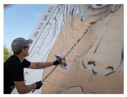
Asti @ the Laundromat - Artist: DEOW