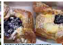
EEDEN SOUTHERN KITCHEN