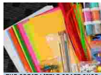
THE GREAT LITTLE CRAFT SHOP