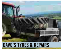
DAVO'S TYRES & REPAIRS