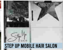
STEP UP MOBILE HAIR SALON