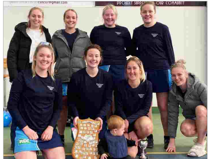
Drummond team, winners of the Winton Night & Day Premier Grade and Ruth Davis Memorial Trophy 2021

Central Southland Netball Centre has just wrapped up another successful netball season. Given the current climate, it was fantastic to get an entire season under our belt, following many disruptions with Covid-19 in 2020. Planning is well underway for the 2022 season and we look forward to seeing many of you at the courts.