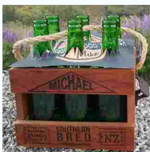
Stubbie or Gift Crates for Fathers Day