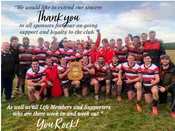
Midlands Senior Rugby Team 2021

The season was an interesting one for the team, with the players and coaches deciding to chance their arm and test themselves in having a crack at the premier grade for the Galbraith Shield.