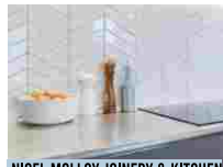
NIGEL MOLLOY JOINERY & KITCHEN