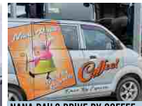
NANA RAILS DRIVE BY COFFEE