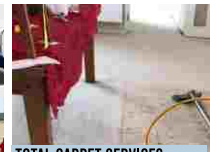
TOTAL CARPET SERVICES