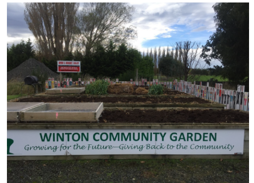
Mitre 10 Site.