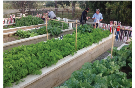
Volunteers placing palings painted by primary school students on the fence surrounding the Mitre 10 Site.