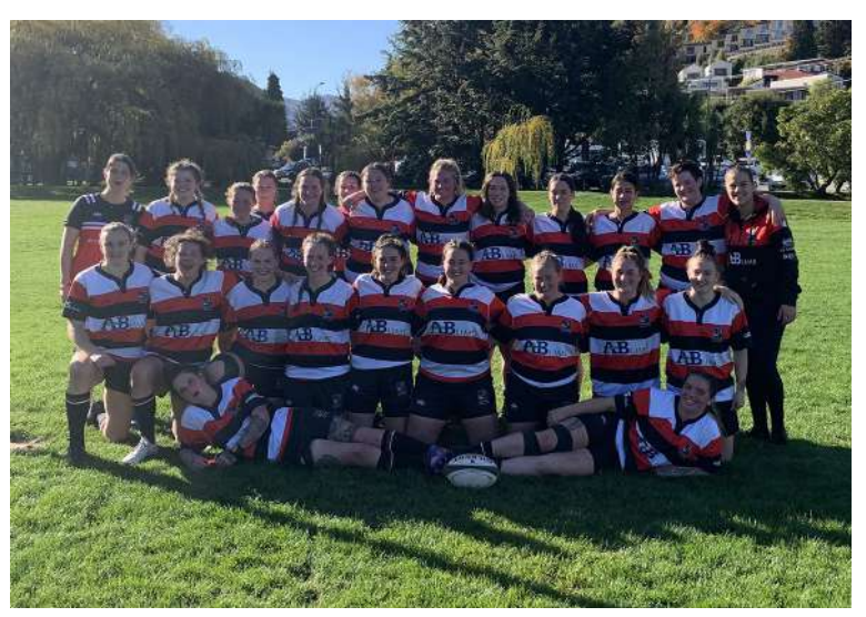
Midlands Women's Team

The Premier Development team who followed the Premiers around this season won several games, even with lending players to the Premier team. They keep progressing each week and have been building a great segway for those starting in Senior Rugby.