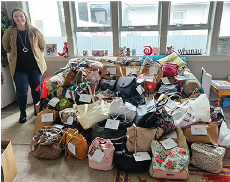
Article and image supplied by With Grace - Winton

The lovely community have donated over 70 bags full of hygiene basics and some other goodies. With Grace will drop off the donations to Invercargill Women's Refuge. The people of Winton really got behind this amazing appeal and wanted to give back to their Southland Community.