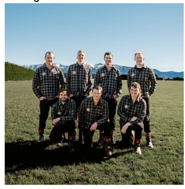
The senior competitors set to take part in the upcoming FMG Young Farmer of the Year grand final.

Check out www.youngfarmers.co.nz for more info.