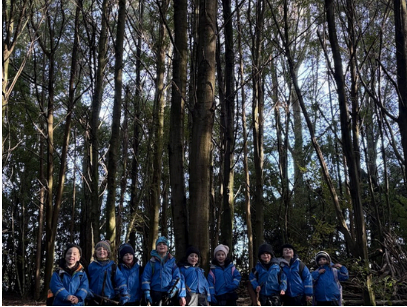
Winton Kindergarten tamariki in the Ivy Russell Reserve

Winton Kindergarten's Taiao Tūhura program continues to inspire the next generation of environmental advocates by giving tamariki the knowledge, tools and confidence to become active guardians – kaitiaki – of their community and environment.