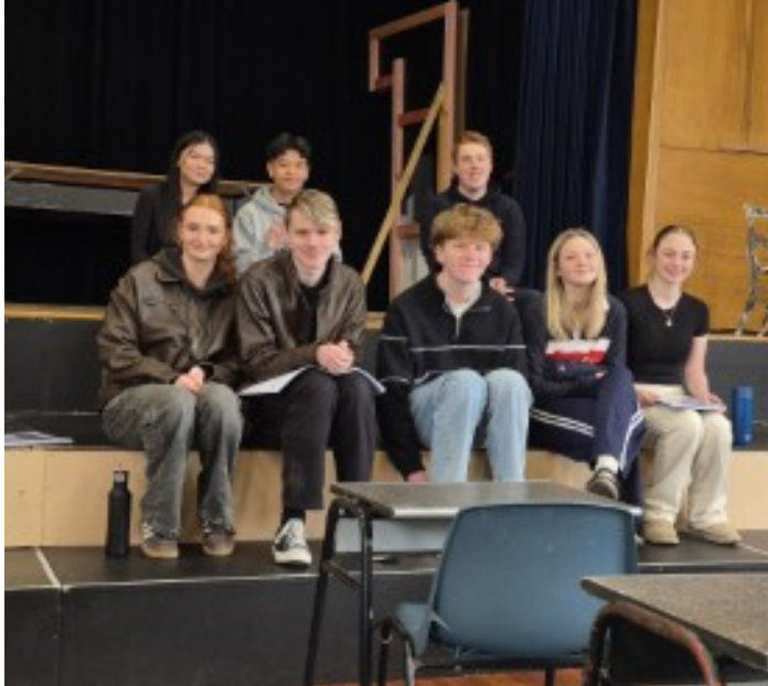
Some of the cast of CSC's upcoming production, Sweeney Todd.

Central Southland College is proud to present, in association with Musical Theatre International (Australasia), Sweeney Todd.