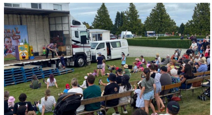
The Magic Guy entertains the crowd at the 2025 Winton A&P Show