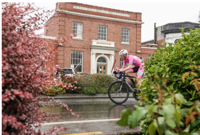
Above and left: Images from the 69 th SBS Bank Tour of Southland, including the McConachie Shearing Time Trial; stage eight of the Tour which was held in Winton in January.