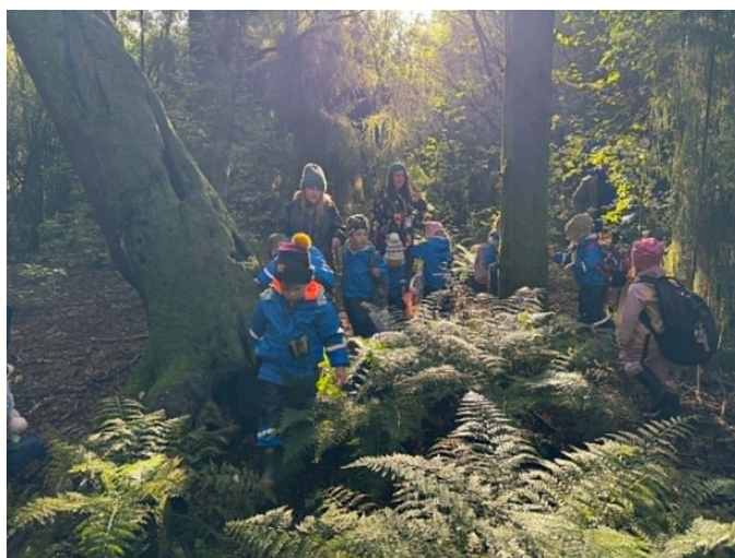
Forest Kindy at Ivy Russell Reserve