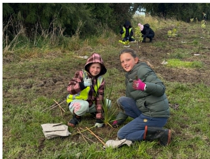
Planting at Kōwhai Reach