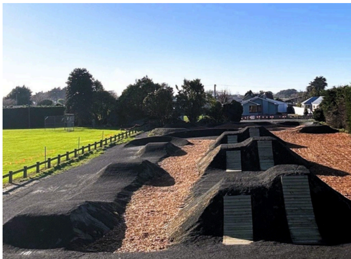
Wallacetown bike park

These informal sessions are an opportunity to meet with community board members, discuss local issues, ask questions, share ideas, or raise matters that are important to you. Whether you have feedback on local projects or suggestions for improving our communities, we'd love to hear from you.