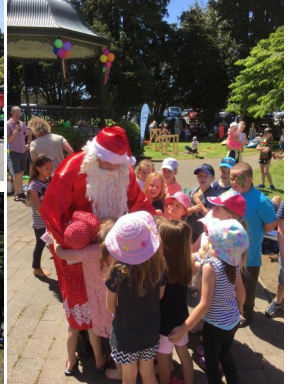
Winton Library 10am to 3pm fun and games 'Bond with your Library'.