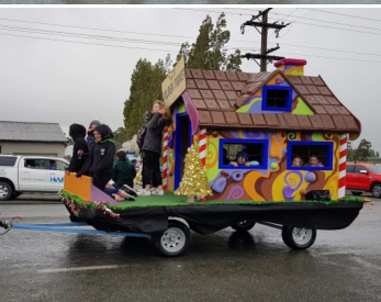
Winton Open Day 2018

Even though the weather did not play it's part for Winton Open day that did not dampen the spirits of the many who ventured out to enjoy the festivities. With the main street lined with activities and information stalls to tempt both young and old to see what was happening. The car and tractor displays had many interested while the businesses had loads of specials and giveaways which bought keen shoppers indoors to purchase that special gift. The memorial hall was lined with stallholders with tasty treats and handmade delights. Santa made an appearance and put a smile on the faces of both young and old. The Teddy Bears picnic was moved to the Presbyterian Church where loads of children had an indoor picnic with their furry friends. The Presbyterian Church Youth group had a fundraising café filled with the most delicious cream cakes and baking the way only Grandma's can make them. The day finished off with a grand parade of floats along the main street. Thank you to everyone that was involved in some way.