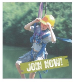
<u>SCOUTS</u> ages 10 - 14 Mondays 6.30 to 8pm

Spaces are available at the Winton Scout Group for boys and girls to have fun and experience new skills.